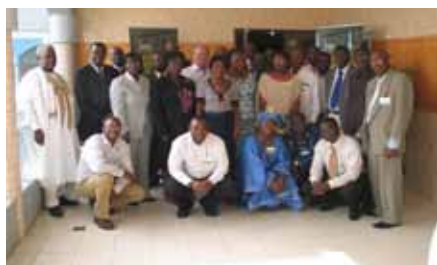
Participants at the Francophone regional Meeting in Cotonou, Benin