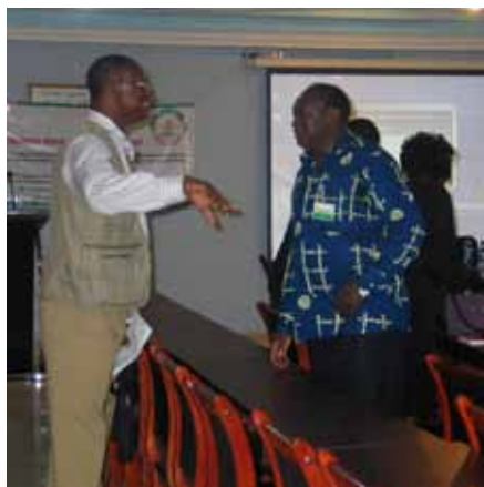
Participants discussing at the Cotonou Regional Workshop